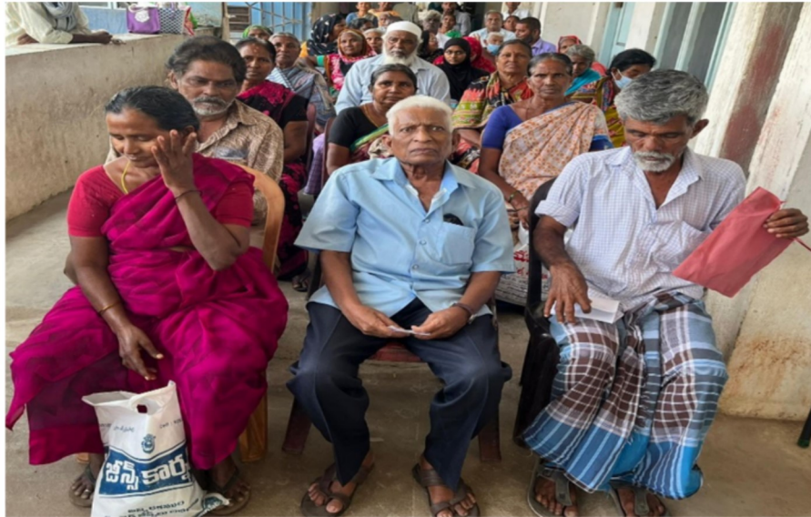
Eye Testing Campaign to all the Needy Patients