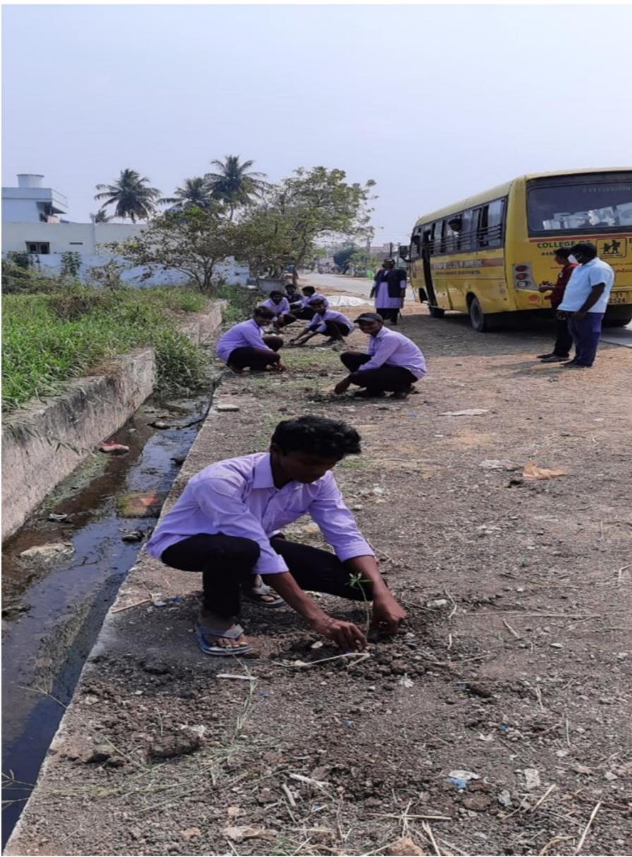
NSS Unit conducted Clean India Campaign 2.0 program in Kanaparru