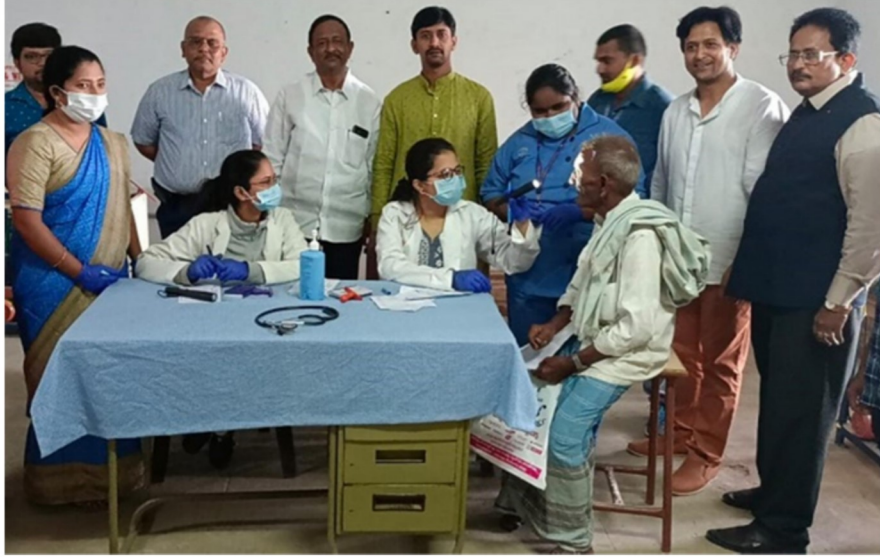
Eye Testing Camp in Kanaparthi Village