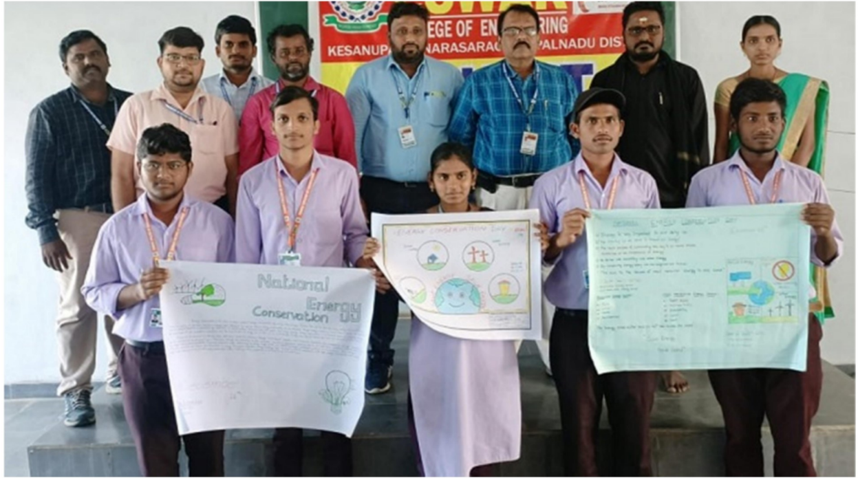
Conduction of National Energy Conservation Day