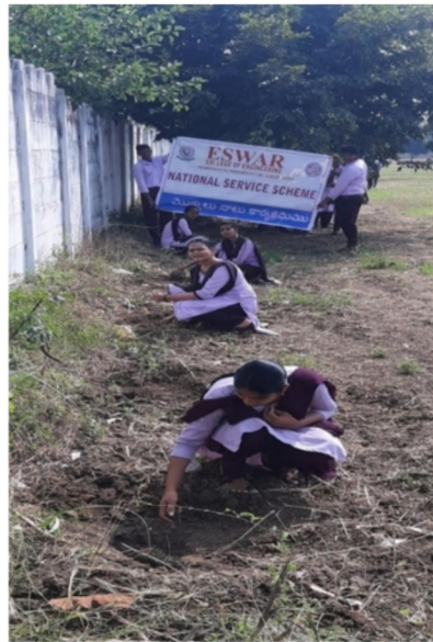
Plantation Program Conducted in Kanaparathi Village