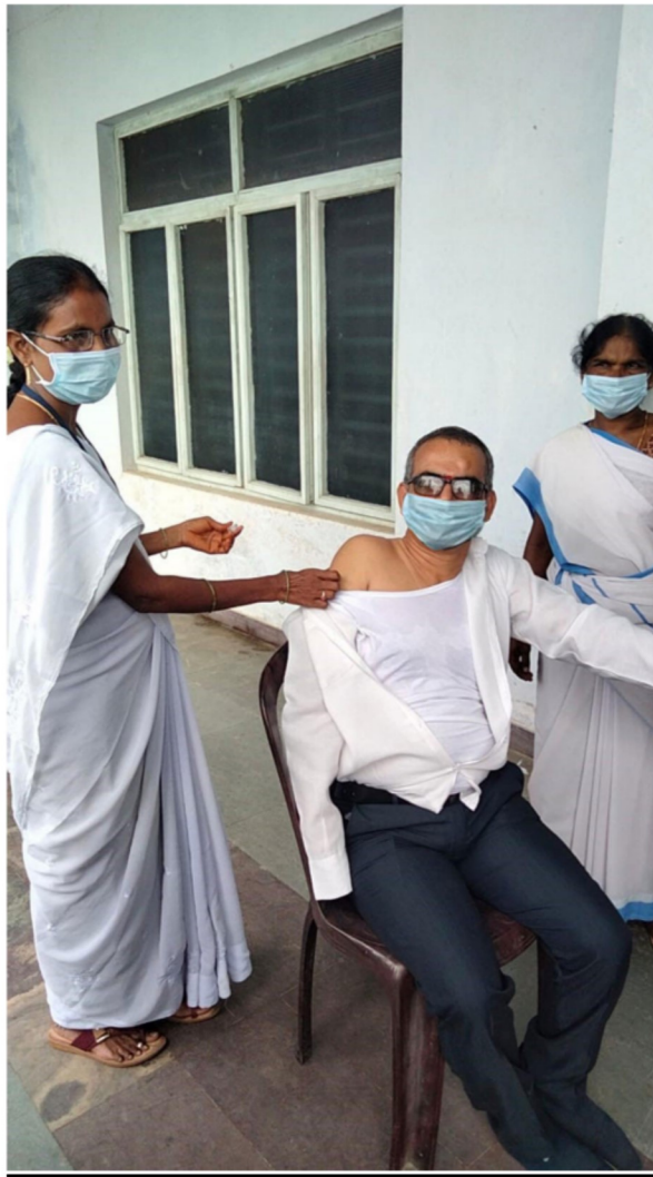
Covid – 19 Vaccinated to Public by PHC Staff – Kavuru