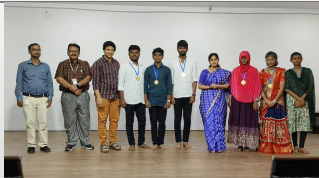
EVENT WISE PRIZE DISTRIBUTION