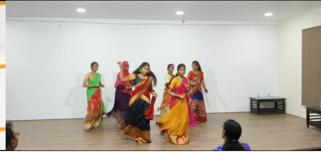
GROUP DANCE PERFORMANCE BY GIRLS