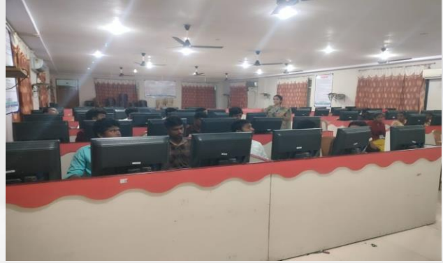
POLYCET MOCK TEST