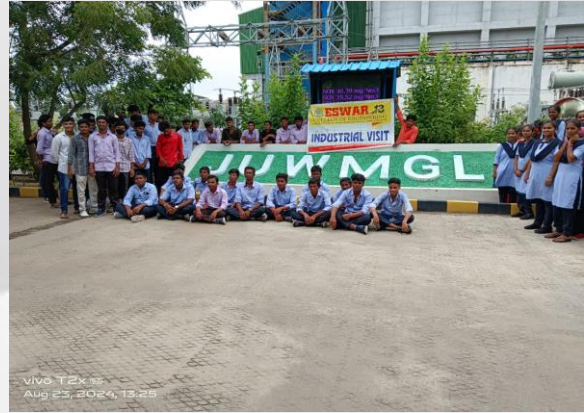
JINDAL URBAN WASTE MANAGEMENT LIMITED, GUNTUR AP on 23-08-2024, 1 ST & 2 ND YEAR (2023 & 2024-Batch)