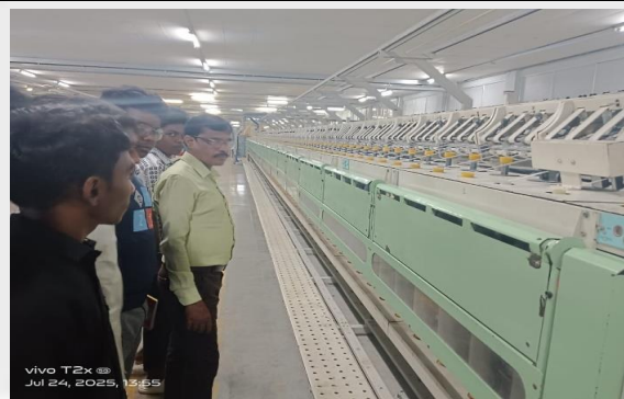
JOCIL, GUNTUR.AP on 30-01-2025, 1 ST & 2 ND YEAR (23 & 24 Batch)