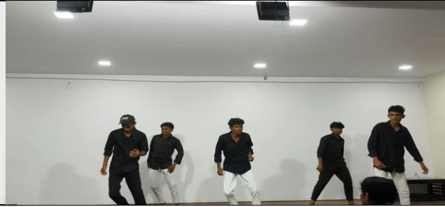
GROUP DANCE PERFORMANCE BY BOYS