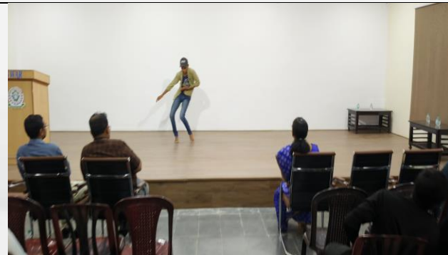
SOLO DANCE PERFORMANCE BY BOYS