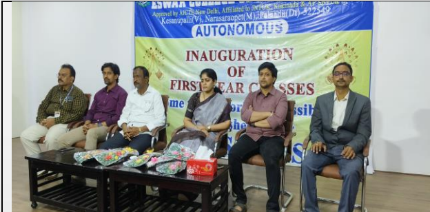
MANAGEMENT AND PRINCIPAL