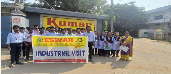
KUMAR PUMPS, TENALI on 28-10-2024, 1 ST YEAR (24-Batch)