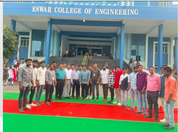
ENGINEER'S DAY CELEBRATIONS