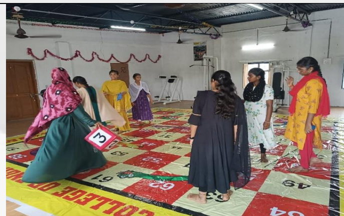
SNAKES & LADDERS