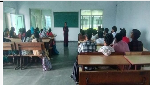
REFLECTION AND GROUP SHARING