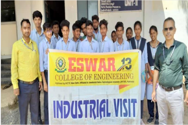
IDUPULAPADU COTTON MILL PVT LTD, MARTUR on 29-2-2024, 1 ST YEAR (2023-Batch)