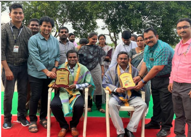
ENGINEER'S DAY GUEST FELICITATION