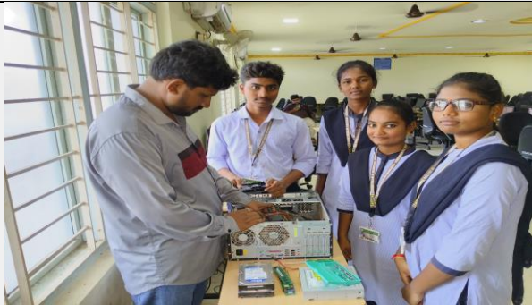
COMPUTER NETWORK AND HARDWARE